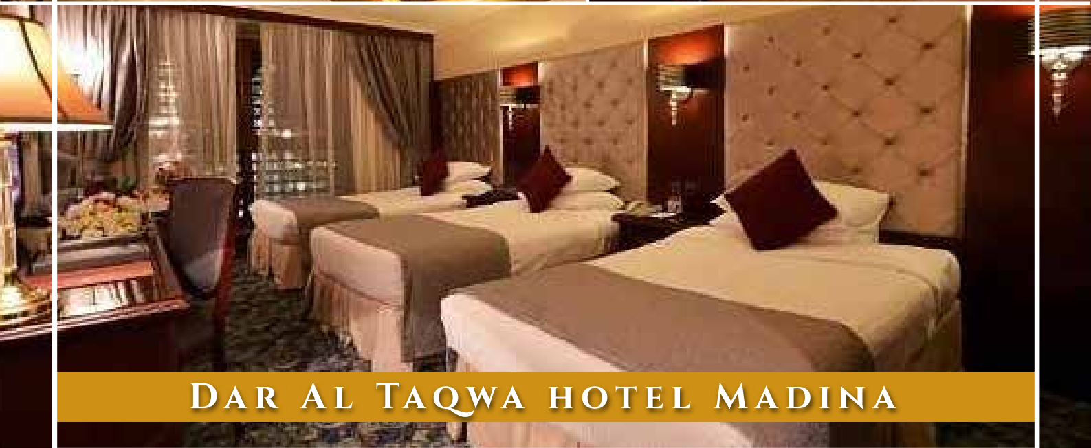
DAR AL TAQWA HOTEL MADINA