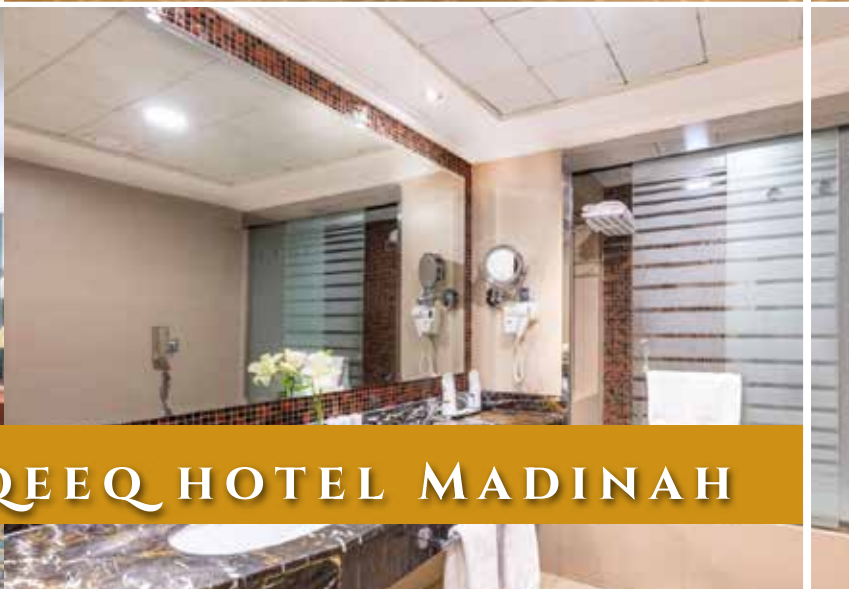
MILLENNIUM AL AQEEQ HOTEL MADINAH